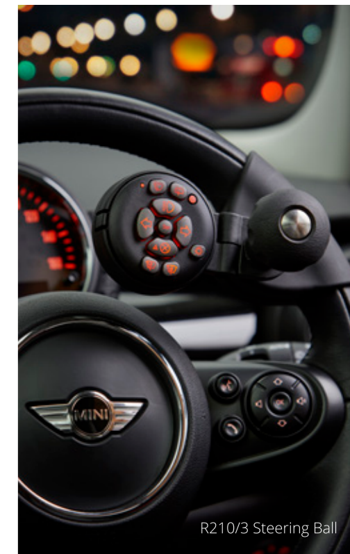
R210/3 Steering Ball